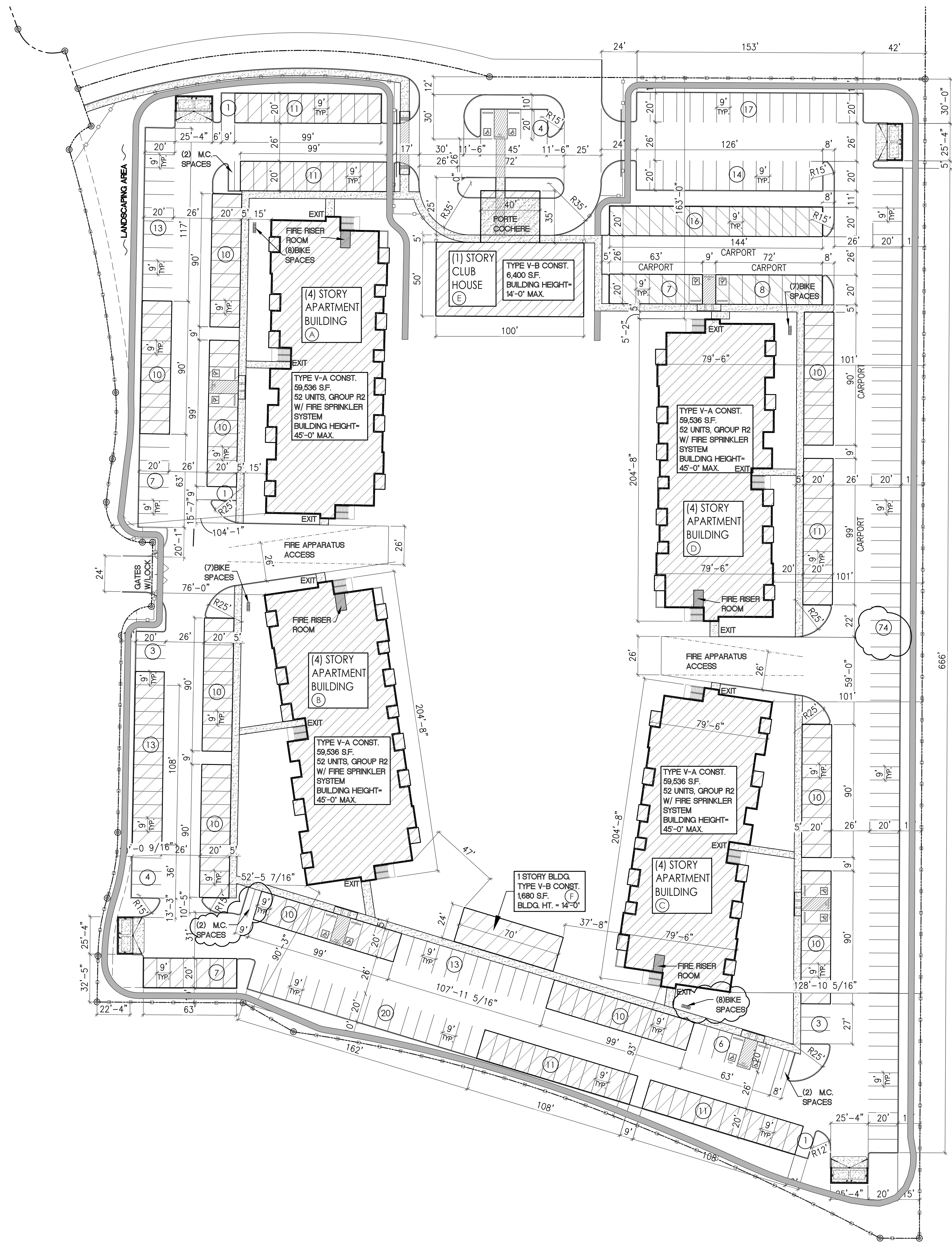
1 ARCH SITE PLAN 1"=40'-0"